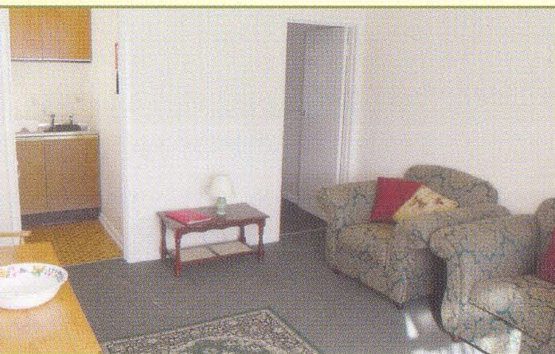
Type 'A' interior

Jurassic Coast – with 95 miles of stunning coastline and designated as a World Heritage Site the famous Jurassic Coast offers visitors a glimpse back through 185 million years of earth's history. Excellent walks and the guided 'Fossil Hunting Trail' along the World Heritage footpaths provide an unforgettable experience.