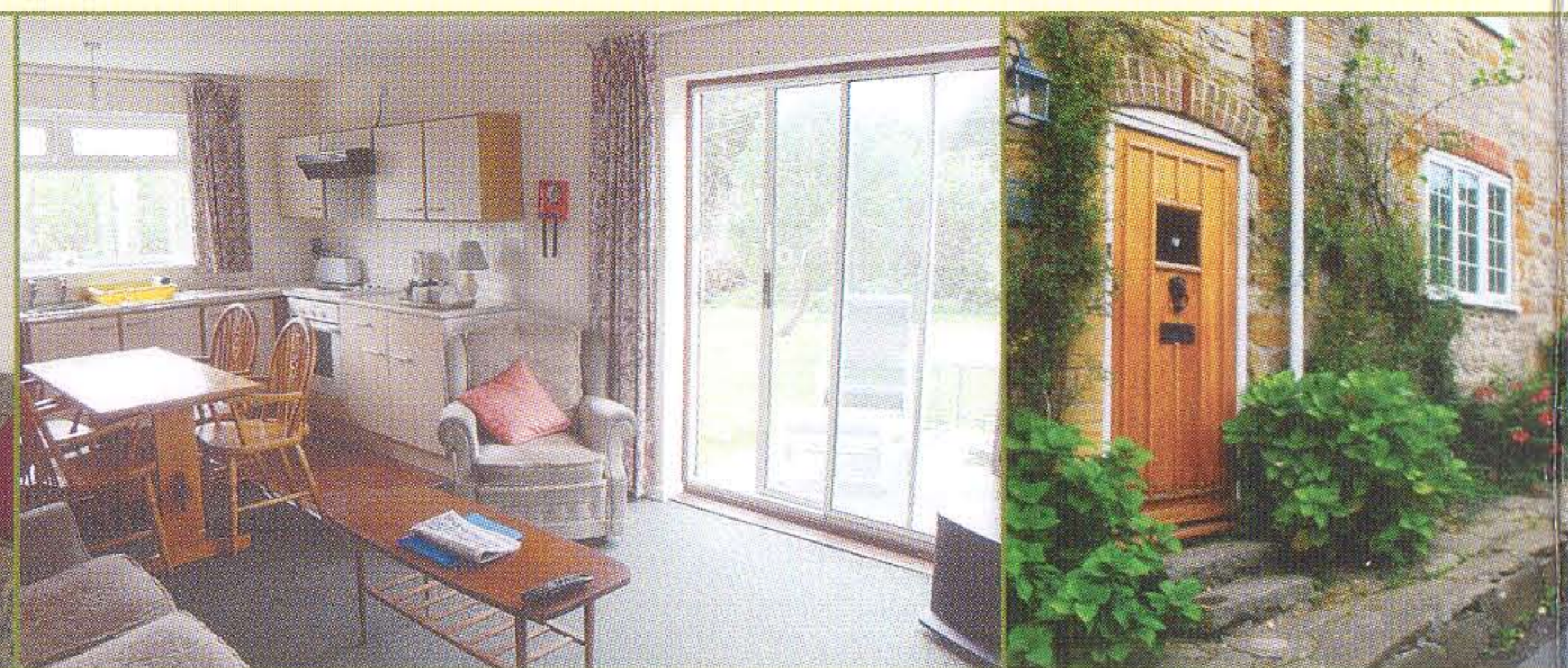
Type 'C' interior